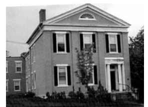
William Potter House